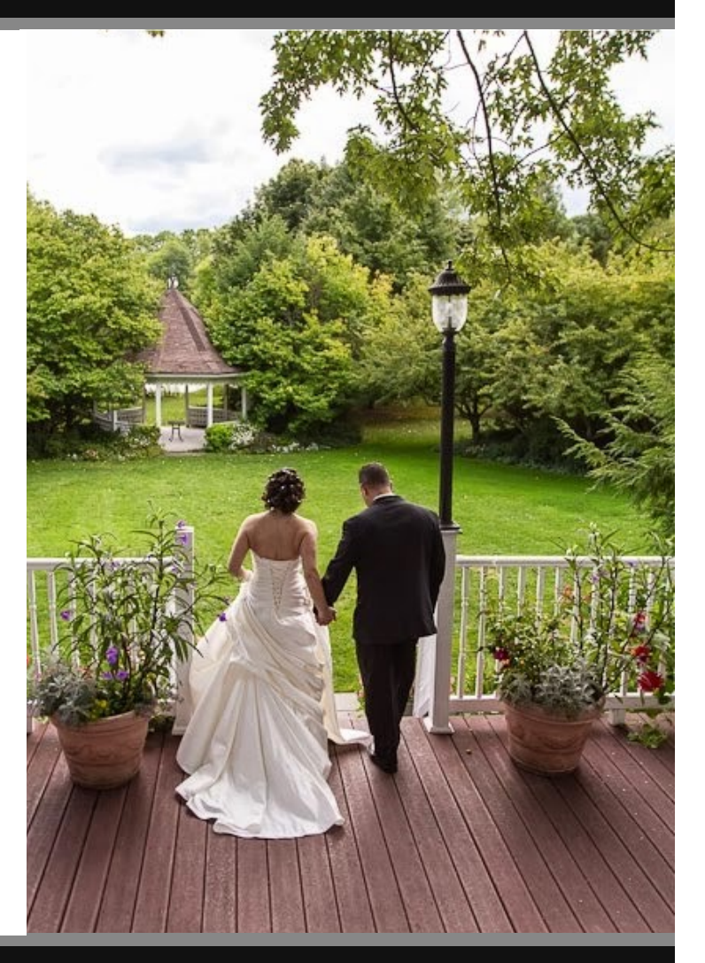
"You Greet Your Guests, We'll Do the Rest"

The Plantation Party House 1875 N Union Street Spencerport, New York 14559