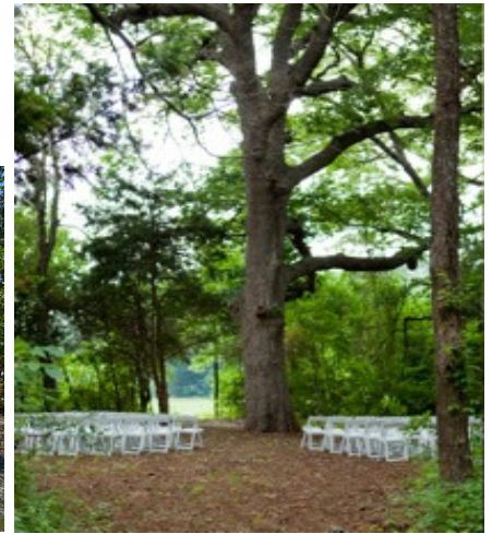
The Secret Garden