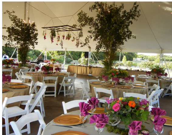
Legends Rose Garden Tent