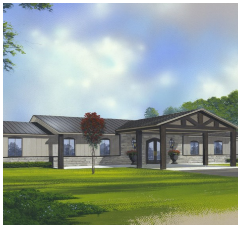
Tuscan Event Center