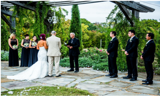
Antique Heritage Rose Garden

Prices are subject to change without notice.