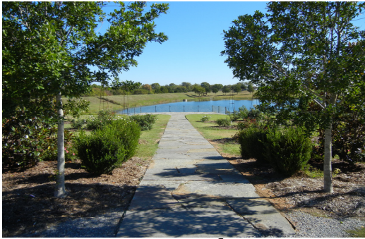
Reflections at Water's Edge