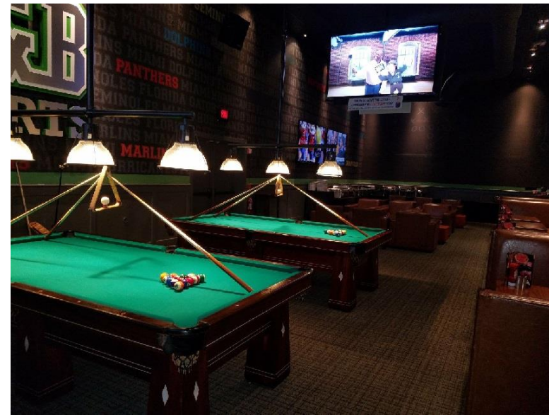
ABOVE: UPPER 2 & 3 SPORTS LOUNGE

ADULT BUFFETS REQUIRE A MINIMUM OF 15 PEOPLE AND $25.00* PER PERSON. *PRIOR TO TAX & GRATUITY