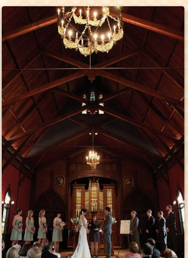
The stunning Edythe Bates Old Chapel was built in 1883 and moved to Festival Hill in 1994. It was lovingly restored to its original beauty and is the perfect location for your very special and intimate wedding.