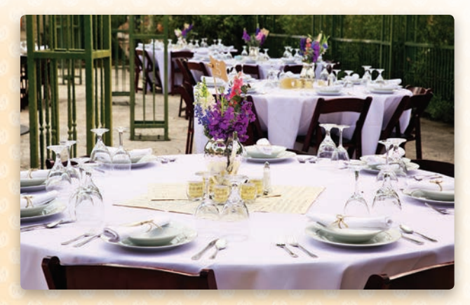
It is a beautiful location for you and your family to rest, gather and get ready for your big day!

The Albert and Ethel Herzstein Memorial Plaza is a fabulous, serene location for your reception. Its beauty