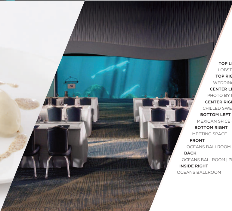
TOP LEFT LOBSTER SALAD TOP RIGHT WEDDING AT GEORGIA AQUARIUM CENTER LEFT PHOTO BY PHILIP GREENBERG CENTER RIGHT CHILLED SWEET PEA SHOOTER BOTTOM LEFT MEXICAN SPICE CHOCOLATE BROWNIE BOTTOM RIGHT MEETING SPACE FRONT OCEANS BALLROOM & ARCTIC ROOM BACK OCEANS BALLROOM | PHOTO BY PATRICK WILLIAMS INSIDE RIGHT OCEANS BALLROOM