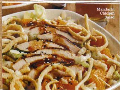
Mandarin Chicken Salad

A wedge of iceberg lettuce, diced tomato, diced red onion, bacon and goat cheese topped with blue cheese dressing, ranch dressing, honey Balsamic glaze and Buffalo sauce. $8.99