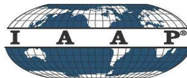
International Association of Administrative Professionals®