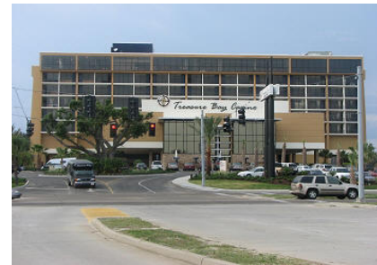
Treasure Bay Casino Biloxi, MS