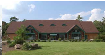
Vecoma at the Yellow River - Snellville