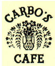
Carbo's of North Buckhead