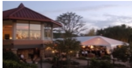
The Park Tavern - Atlanta