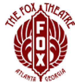
The Fabulous Fox Theatre Atlanta