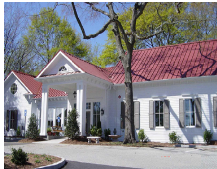
The Arbors - Alpharetta