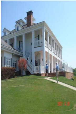
Whitewater Creek C.C. - Peachtree City