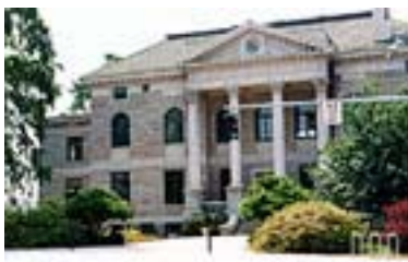
The Old Courthouse Decatur