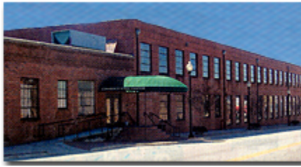
The Civic Center - Commerce, GA