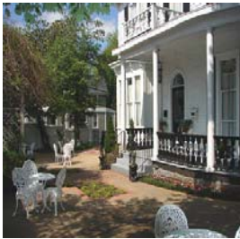
The Stanley House Inn - Marietta