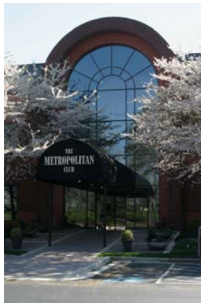
The Metropolitan Club - Alpharetta