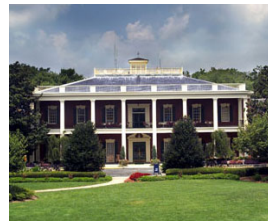
Stone Mountain Inn - Stone Mountain