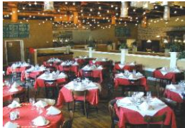
Fratelli Di Napoli - Historic Roswell