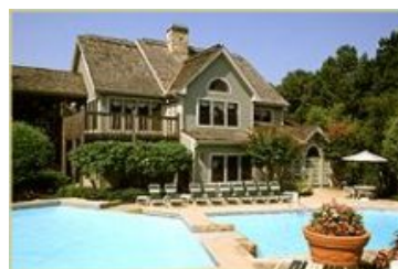
Calibre Brooke Apartments Smyrna