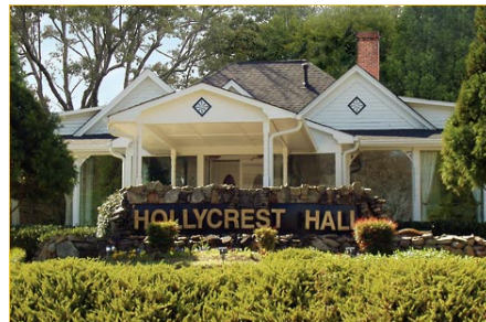
Hollycrest Hall - Marietta