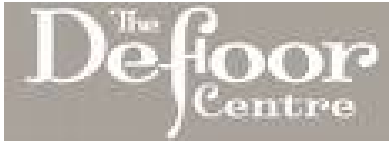
The DeFoor Centre - Atlanta