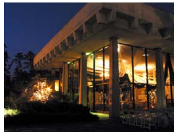
The Atrium Norcross