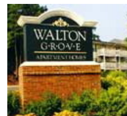
Walton Grove Apartments Smyrna