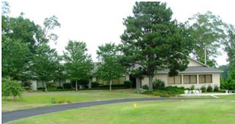
Wendell Coffee Event Center Peachtree City