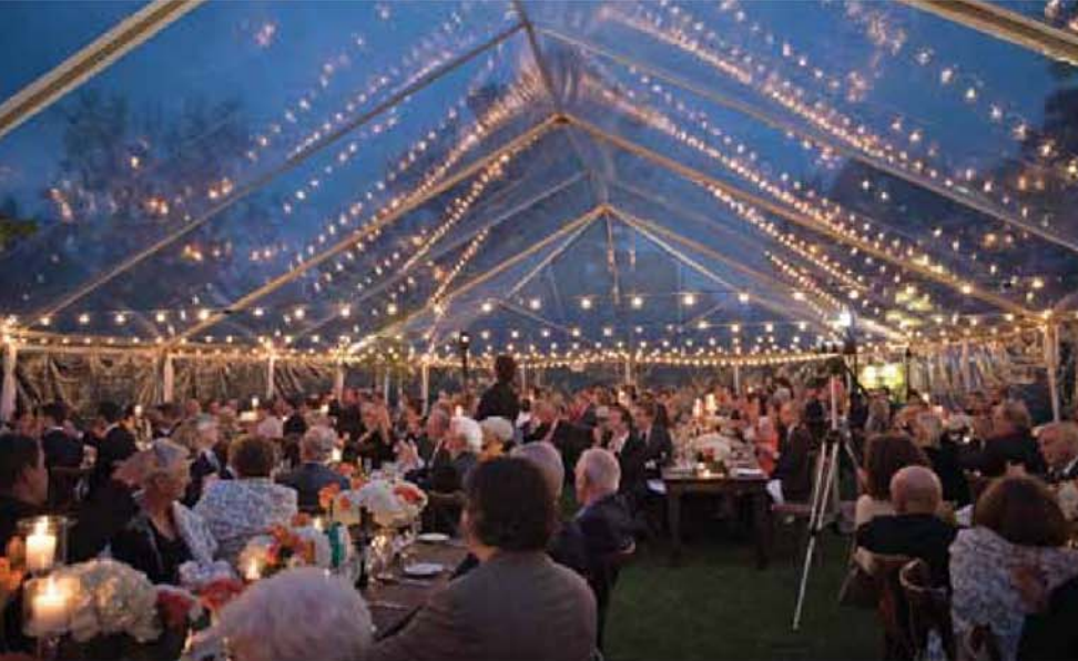
The couple joined guests in a clear tent that allowed the beauty of Muskoka to shine through.

bride-to-be. He says he will never forget the moment he turned around and saw her standing there in her flowing gown, her blond locks falling loosely over her shoulders.