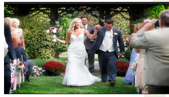
Rustic but Elegant Ceremony spaces!

by the Smithsonian as "One of Top Small Towns in America"