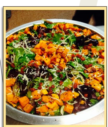
Butternut squash & fresh greens

The food ... this is not your run-of-the-mill wedding food that makes everyone go "meh." Their food is amazing! We went to several supper clubs to try out some of their different offerings and were never disappointed. Since they do their tastings at their supper clubs, you also get to see what the food will taste like when prepared for more than just a couple of people, - Ashley & Jason Nov. 2014