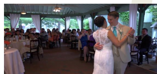
Beautiful 2500 sq. ft. Year Round Pavilion!