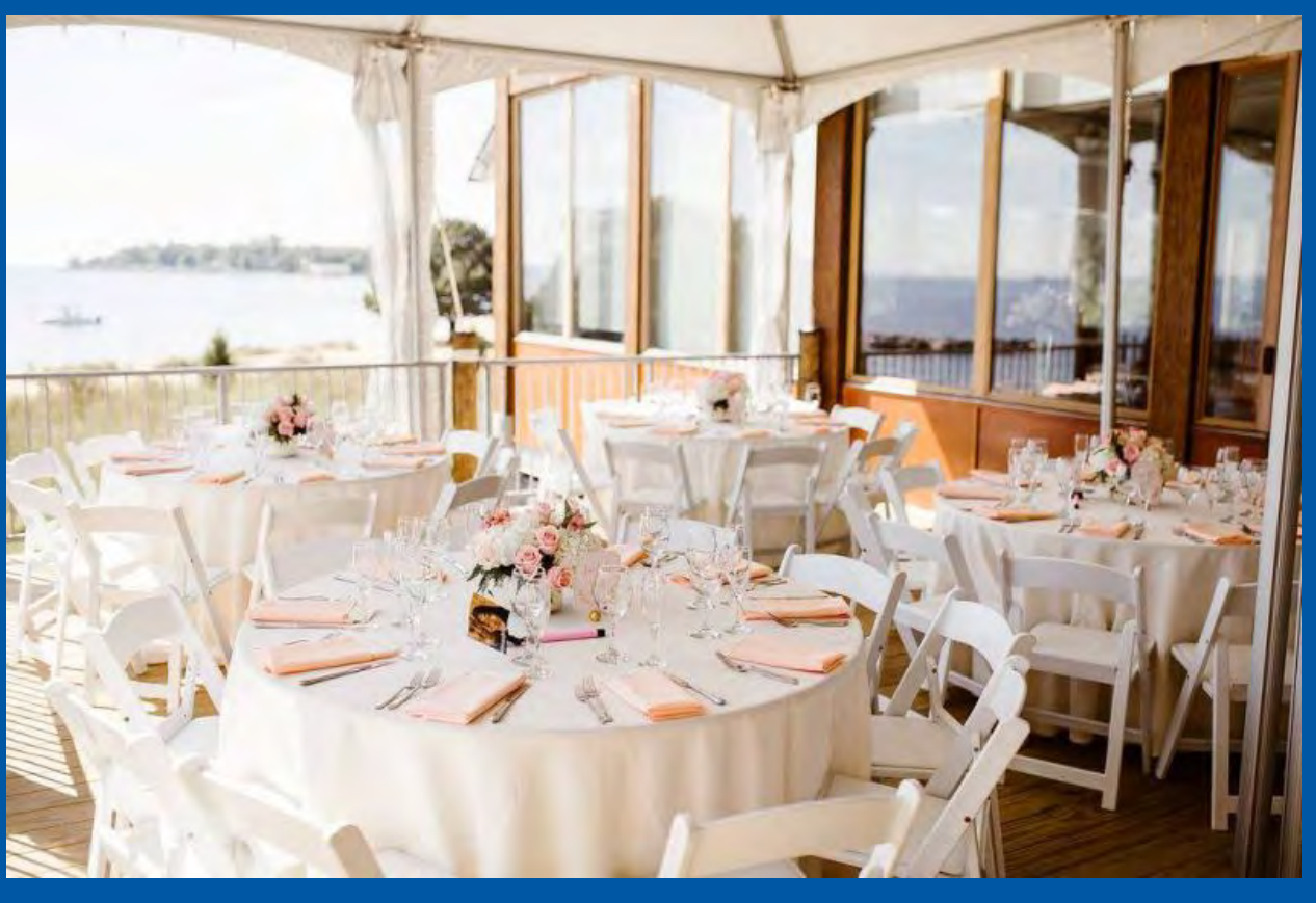
Dining Room-Canvasback Room