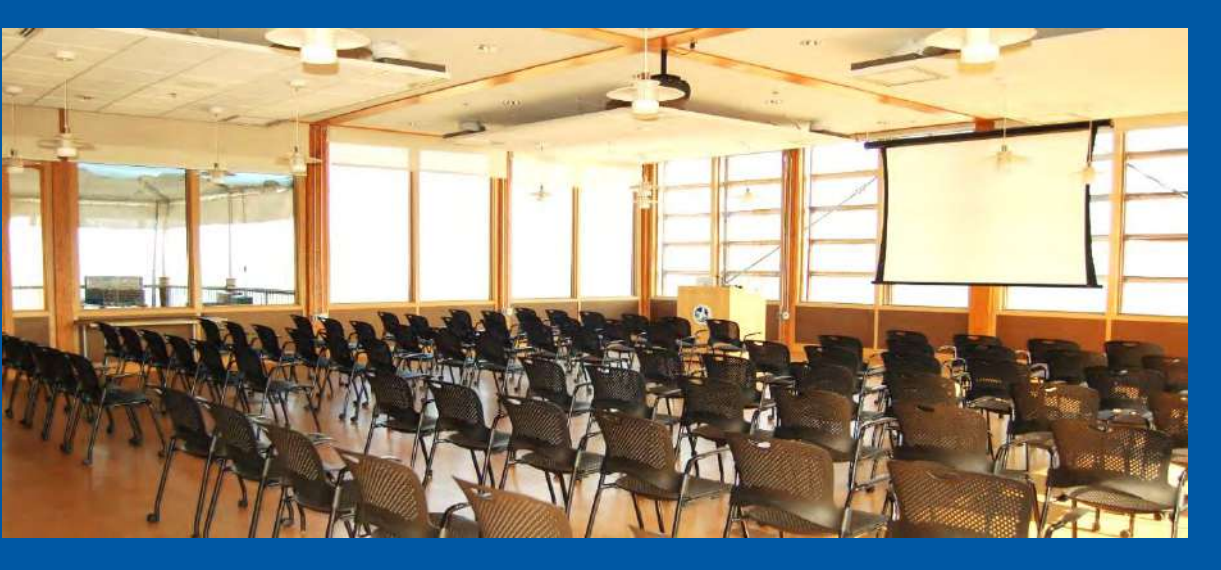
The Canvasback arranged in theater style (shown left) can hold a capacity of 80 people.

The Canvasback arranged in boardroom style (shown right) can hold a capacity of 40-60 people.