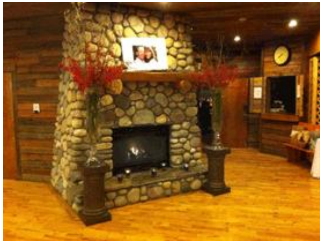
Lobby entrance at Cornerstone Theatre

Our 500 sq ft stage, complete with decorations, is perfect for your ceremony, head table or for hosting your band or DJ. Here at the Cornerstone Theatre we are also able to offer the venue as a 'back up ceremony' elevated on stage or intimately placed around the fireplace should the inclement weather in the Rockies not be kind.