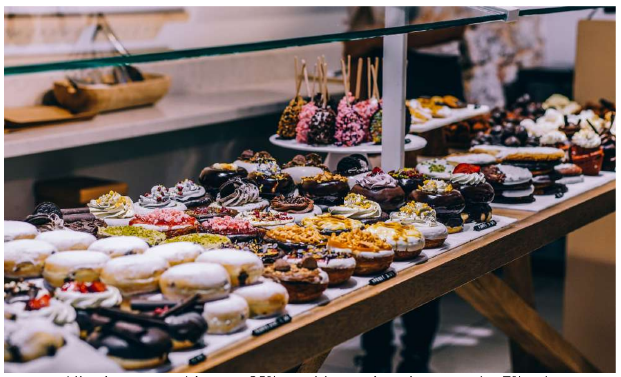
All prices are subject to 25% taxable service charge and a 7% sales tax

Chocolate Bars, Jumbo Marshmallows & Graham Crackers