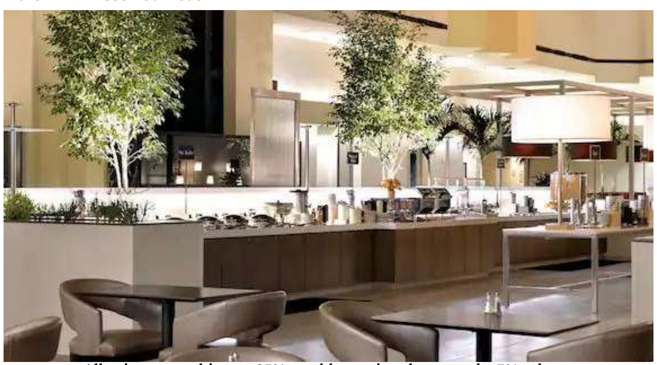
All prices are subject to 25% taxable service charge and a 7% sales tax

Chilled Florida Orange & Apple Juices Fresh Brewed Regular & Decaf Coffees Hot Water with Assorted Teas