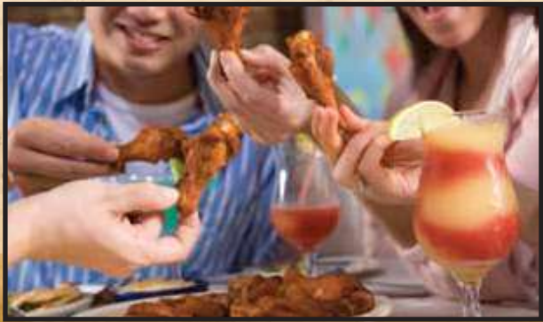
Prices and menu items in effect at time of printing; but subject to change.

Flan A light custard with caramel sauce. $5.50