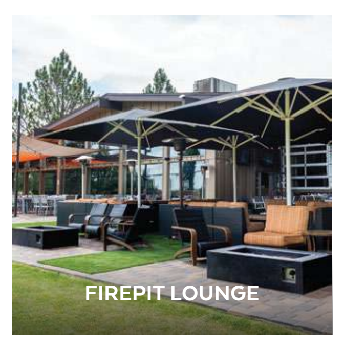
GROUP SIZE 45 $3500 Space Fee