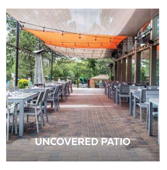
GROUP SIZE 75 $7500 Space Fee