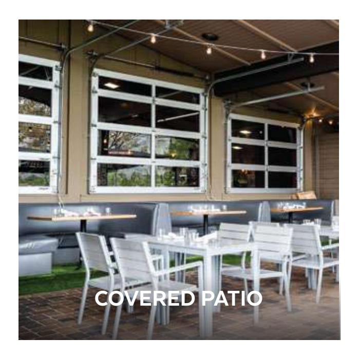
GROUP SIZE 25 Excludes Firepit Lounge • $1500 food and beverage minimum