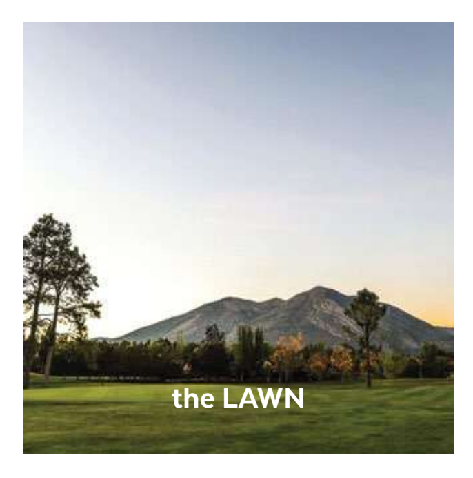
GROUP SIZE UNAVAILABLE Details available for future consideration