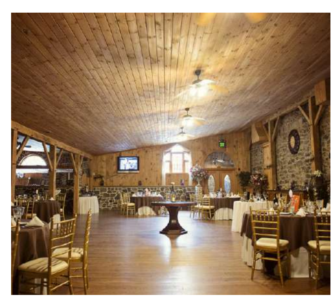
The Cove capacity 85