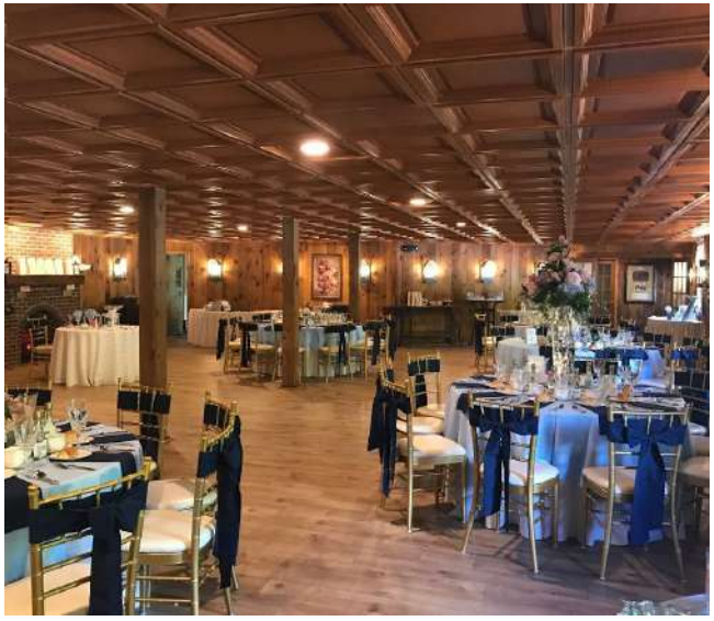
Windsor Court capacity 100