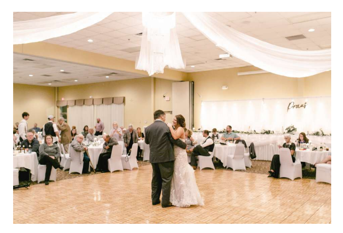
"Creating Lasting Memories for Every Occasion"