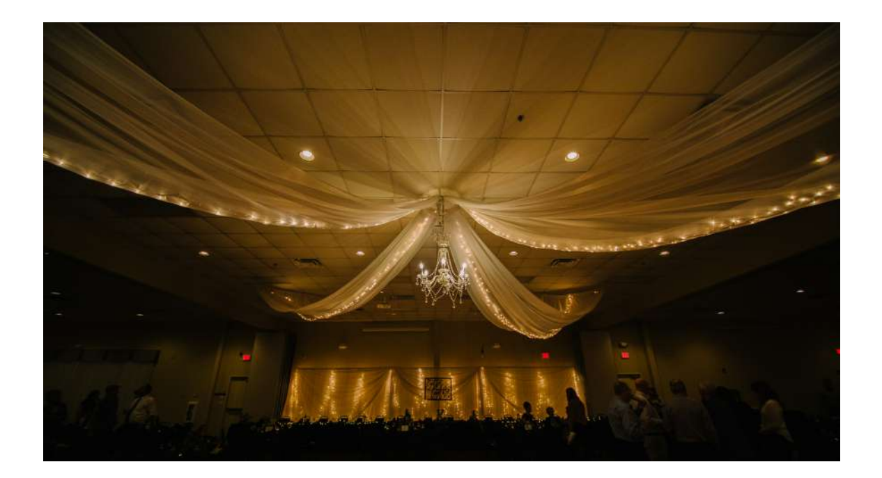
Dance the night away