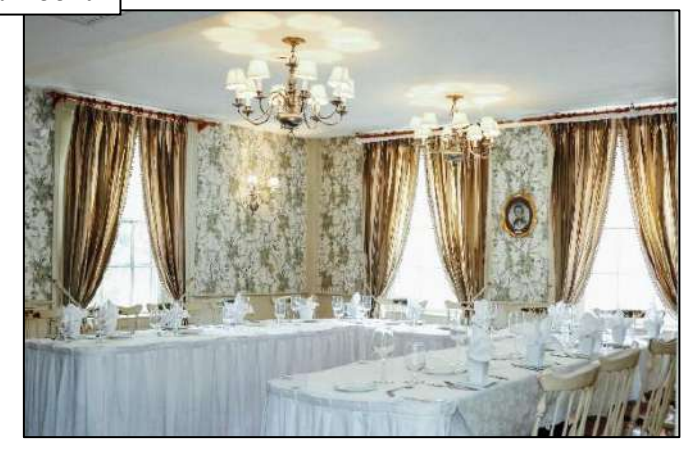
Business U-Shape seating up to 14 guests.

*Consuming raw or undercooked meats, poultry, seafood, shellfish or eggs may increase your risk of food borne illness. Before placing your order, please inform your server if a person in your party has any food allergies.