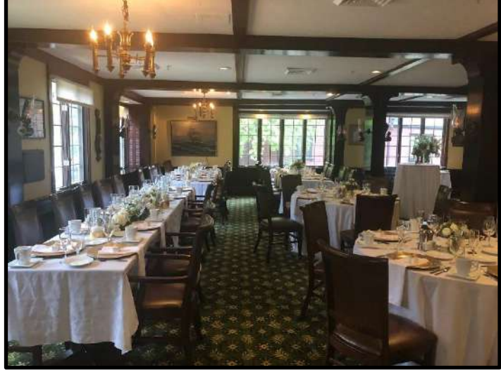
Our Merchant's Row Dining Room can be rented for Private Events & Parties.