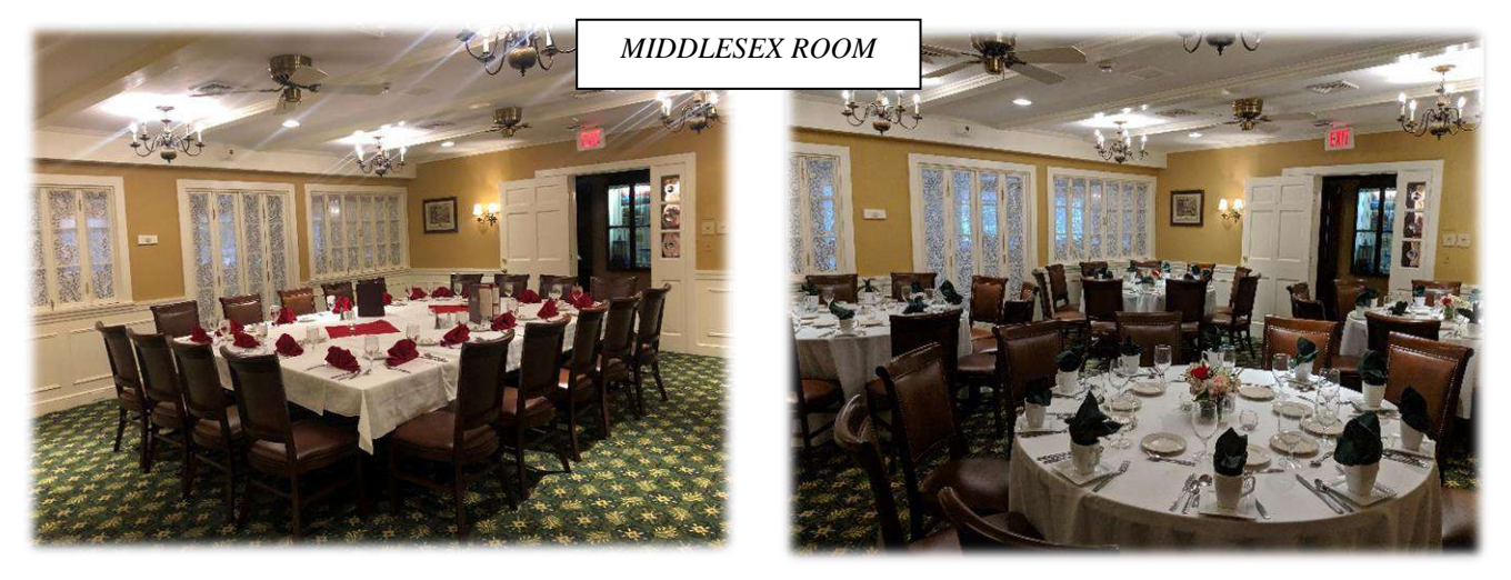
Seats up to 16 guests U-Shape, 18 guests at one table, and 32-36 guests with round tables.

*Consuming raw or undercooked meats, poultry, seafood, shellfish or eggs may increase your risk of food borne illness. Before placing your order, please inform your server if a person in your party has any food allergies.