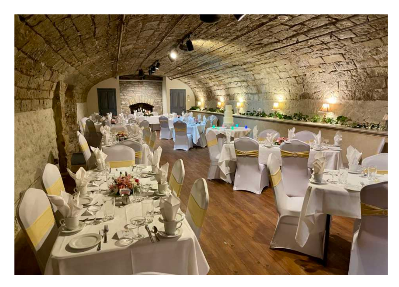
VINEYARD ROOM - MAXIMUM CAPACITY 96