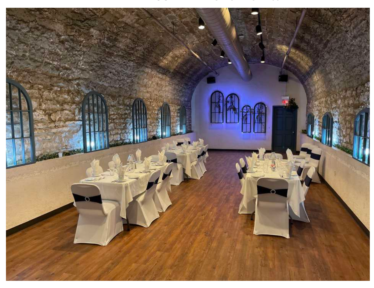
WINDOWS ROOM - MAXIMUM CAPACITY 40