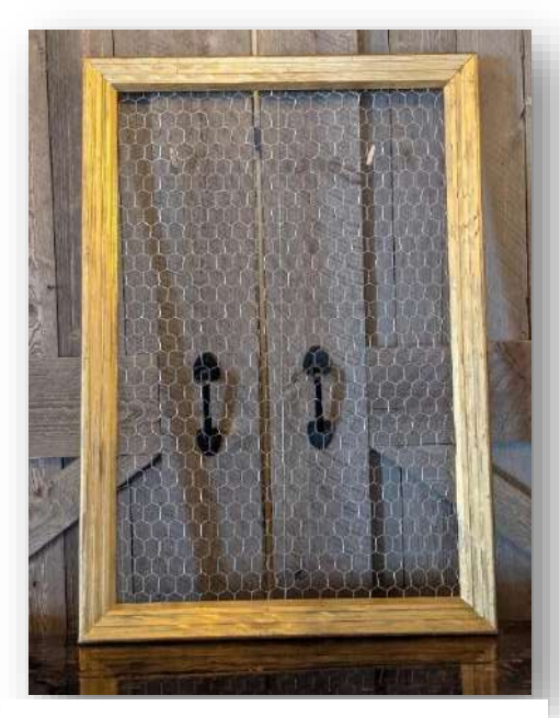
Gold Frame with Chicken Wire