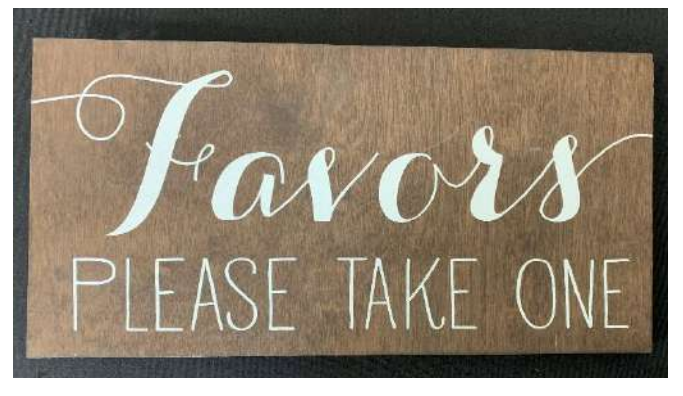
Wooden Sign with White Lettering- "Favors Please Take One."