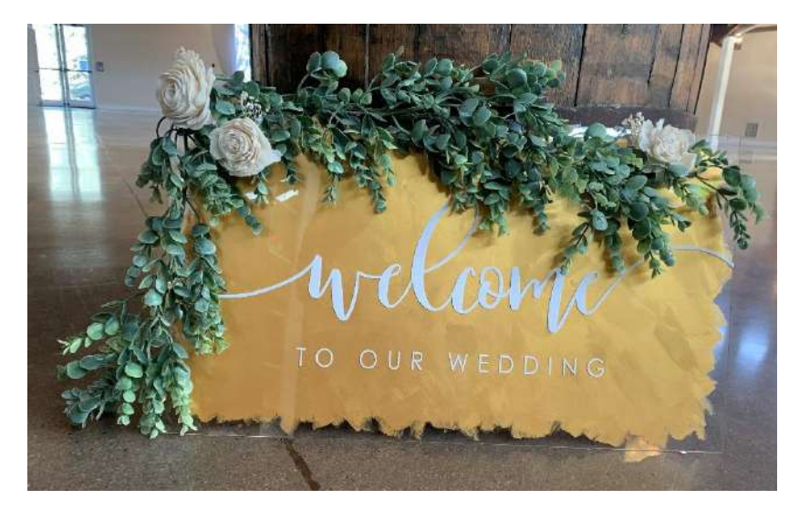
An Acrylic Sign with a Gold Background and Greenery Along the Border- "Welcome to Our Wedding."