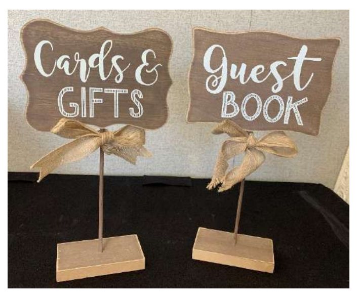
Tall Wooden Signs- Cards & Gifts, Guest Book