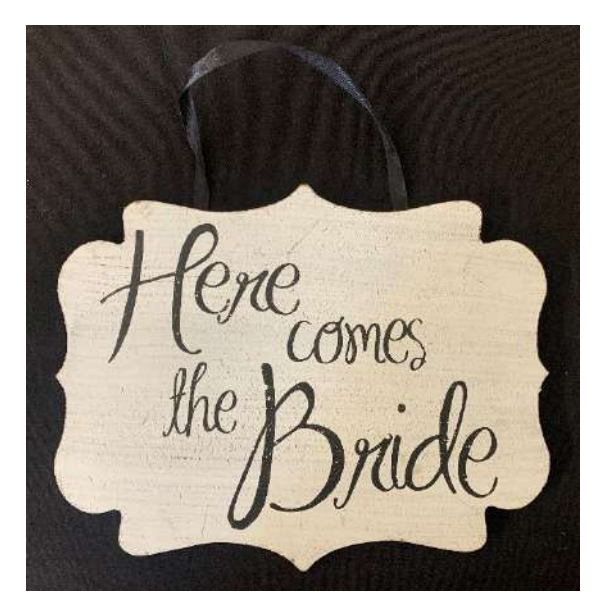
Small Carrying Sign- "Here Comes the Bride."