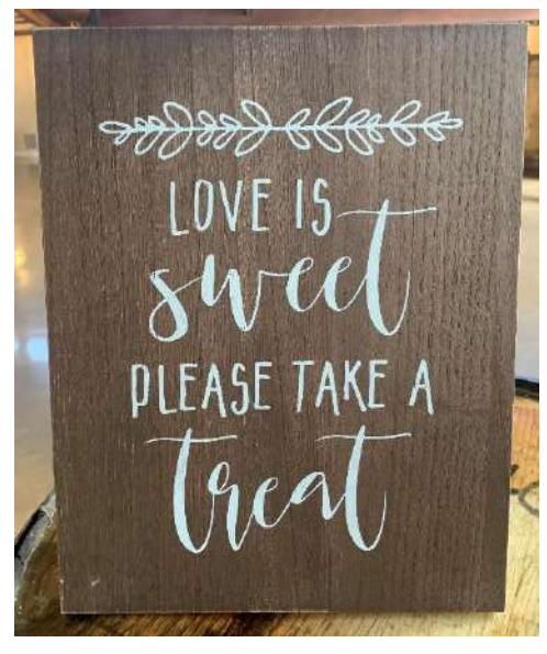
Wooden Sign with White Lettering- "Love is Sweet Take a Treat."