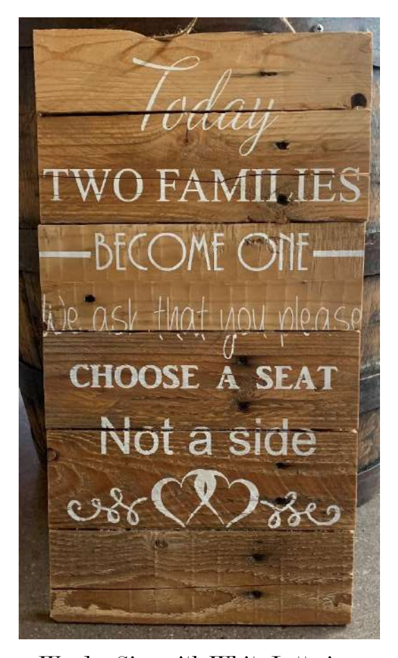
Wooden Sign with White Lettering-"Today two families become one. We ask that you please choose a seat not a side"