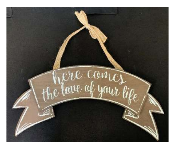
Carrying Sign- "Here comes the love of your life."