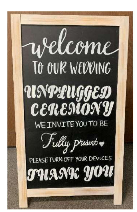
Chalkboard Sign with Wooden Border-"Welcome to our wedding. Unplugged Ceremony. We invite you to be fully present. Please turn off your devices. Thank you."