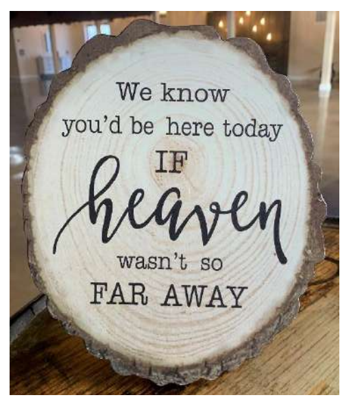
Small Oval, Wooden Sign- "We know you'd be here today if heaven wasn't so far away."