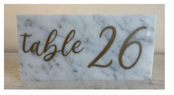
Type some fancy thing about our table numbers