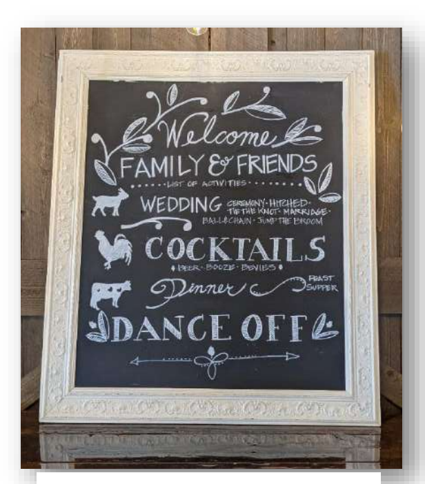
Large Chalkboard Sign with White Framing- "Welcome Friends & Family. List of Activities"