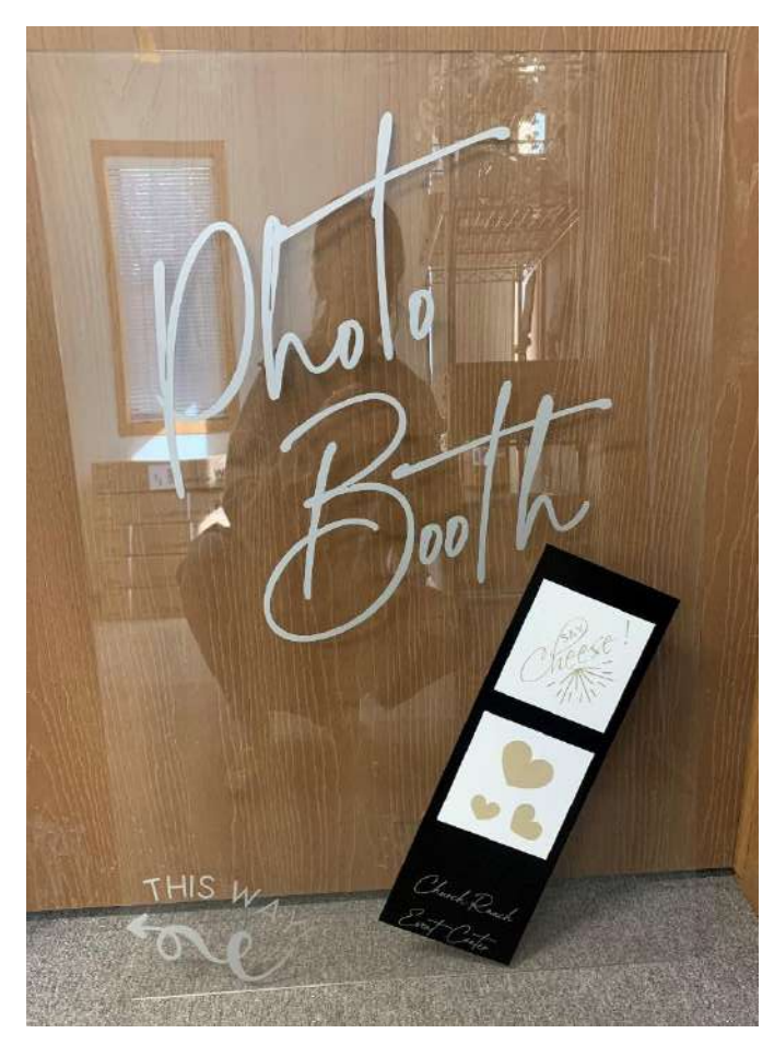
Acrylic Sign- "Photo Booth this way"