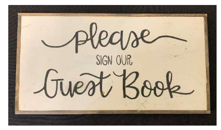
Please Sign Our Guest Book