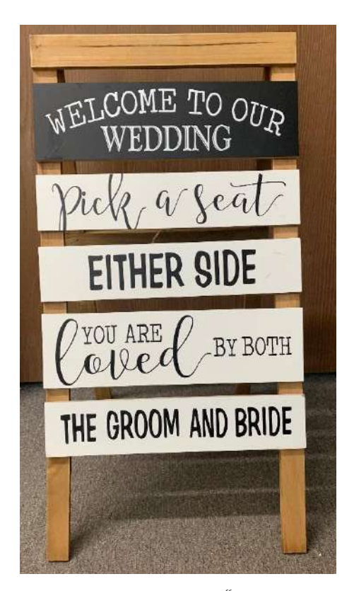
Black and White Sign- "Welcome to our wedding. Pick a seat either side, you are loved by both the groom and bride."