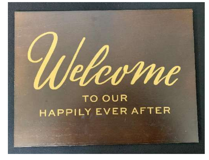
Wooden Sign with Gold Lettering-"Welcome to Our Happily Ever After."