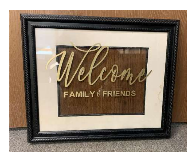
Framed Welcome Friends & Family Sign with Gold Lettering