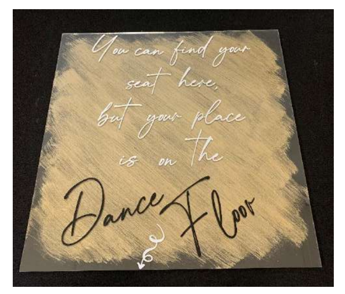
Acrylic Sign with Gold Background- "You can find your seat here, but your place is on the Dance Floor."