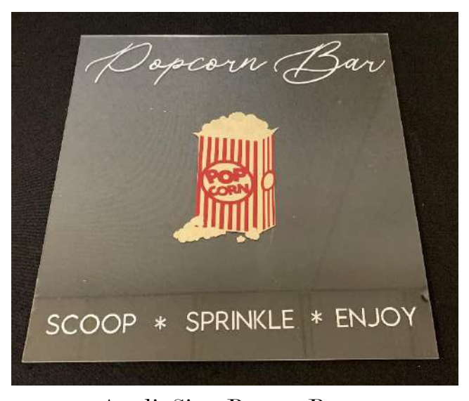
Acrylic Sign- Popcorn Bar