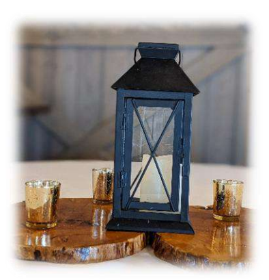
Simple and classic, our modern lanterns are a great way to add an elevated feel to your ceremony and reception.