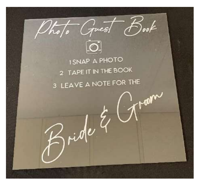
Acrylic Sign- Photo Guest Book