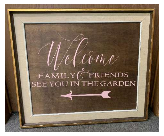
Wooden Sign with Gold Framing-"Welcome Friends & Family, See you in the garden."