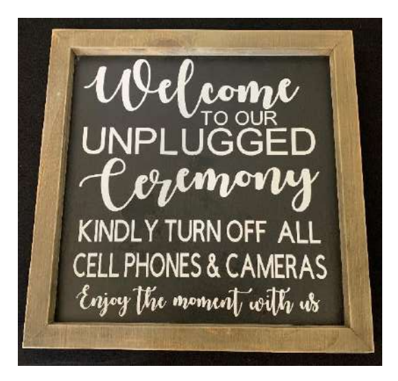
Small Chalkboard sign with Wooden Border- "Welcome to our unplugged ceremony. Kindly turn off all your cell phones and cameras. Enjoy the moment with us."