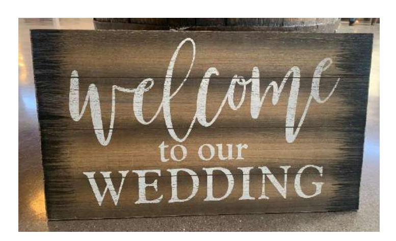
Wooden Sign with White Lettering-"Welcome to Our Wedding"