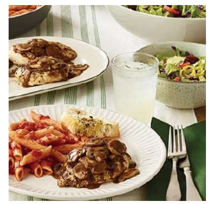
Starting price point per person - $30 Includes staffing