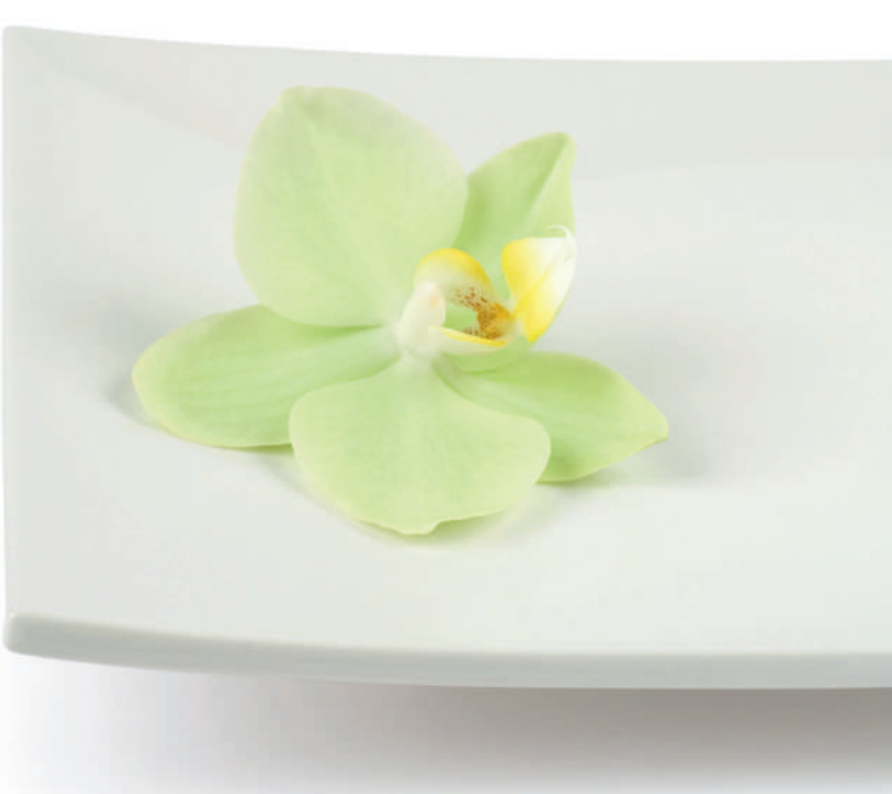
3:19 PM The space, the light, the air. This is the perfect backdrop to forever.