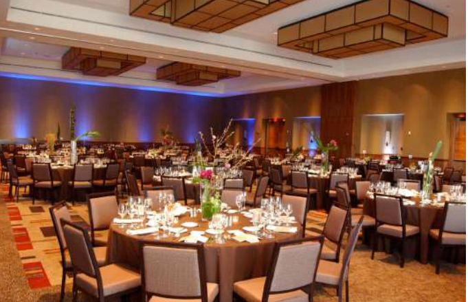
Clockwise from top left: Private dining room at Sauciety restaurant, The Pavilion, Marina Ballroom, Harbor Ballroom.