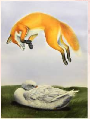
"Swan and Nest"