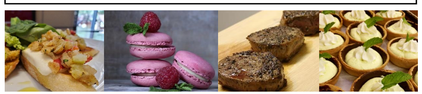
A 20% Service Charge and 8.25% Sales Tax will be Applied to All Food and Beverage Pricing. All Menus and Prices are Subject to Change