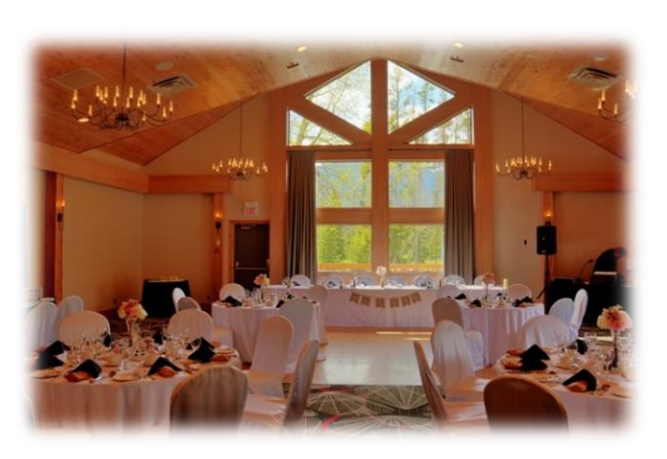
When I saw you, I fell in love. And you smiled because you knew.