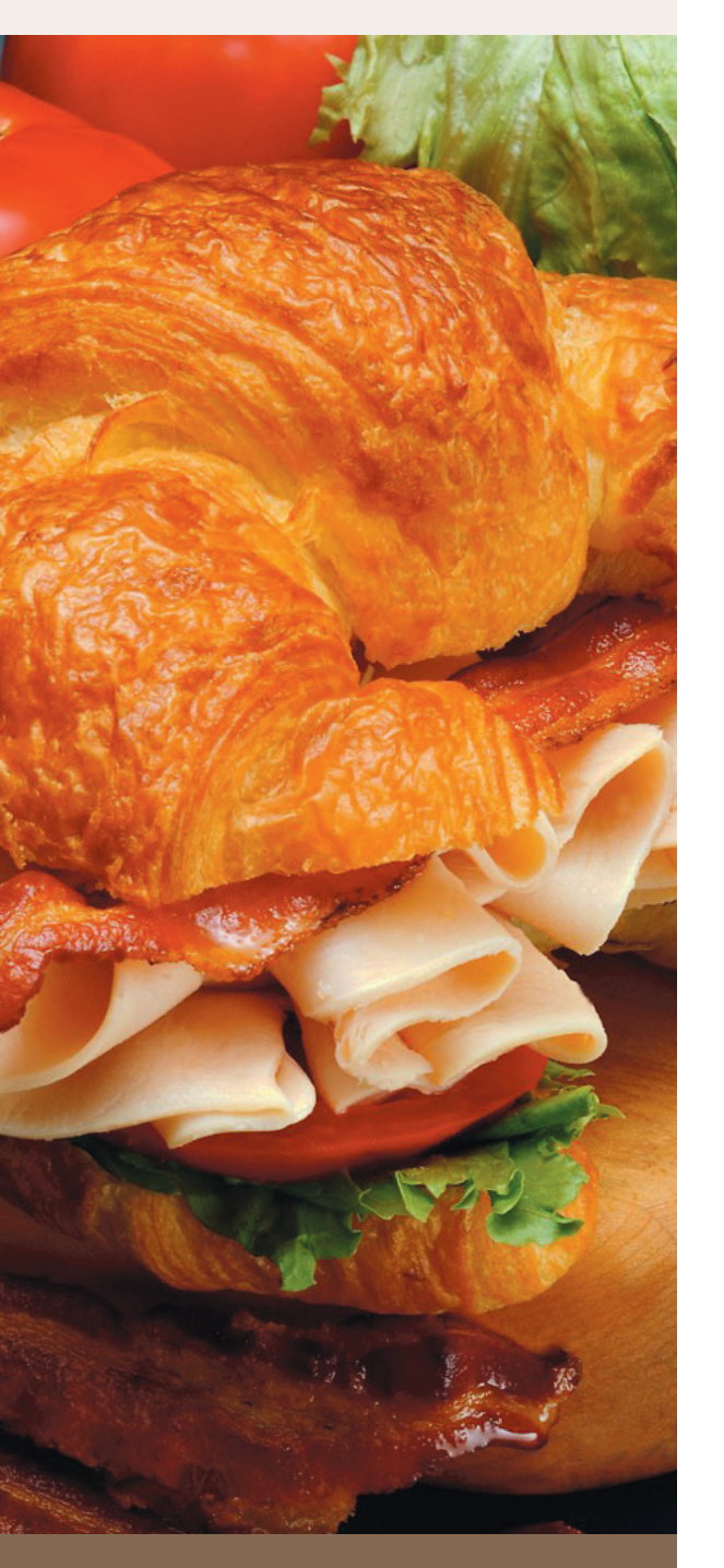
ADDITIONS, IF APPLICABLE