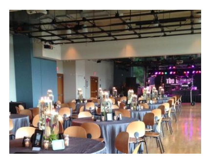
Esch Hurvis Studio, Esch Hurvis Room and Mead Witter reception with chair upgrade (upgrade involves a fee and is dependent upon availability)