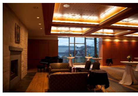
The Nathan Marsh Pusey Room provides an elegant setting for meetings or business receptions

These formal gathering spaces of the University can be utilized individually or combined to accommodate larger meetings and banquets. Both rooms are equipped with state of the art A/V inputs and lighting. The Somerset Room features a maple floor, vaulted ceiling and a wall of floor-to ceiling windows overlooking the Fox River. The Nathan Marsh Pusey Room is adorned with a rich quarter-sawn cherry interior, a cozy fireplace and breathtaking views and can be reserved for small meetings, receptions, recitals and intimate dinners.