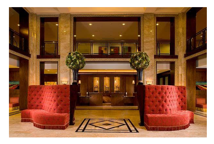
LOBBY OF HOTEL