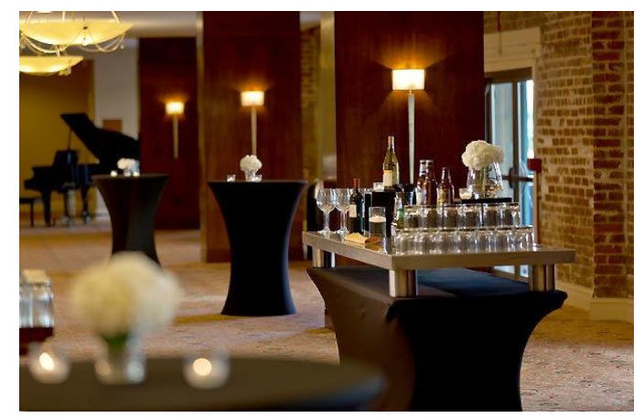
FOYER OF BLAINE KERN BALLROOM