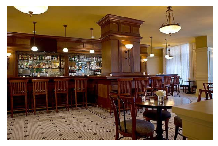
WOLFE'S IN THE WAREHOUSE RESTAURANT