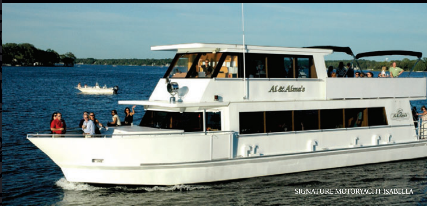
SIGNATURE MOTORYACHT ISABELLA

Whether you're aboard Isabella for celebrations of 59 guests or less, or aboard the Twin Cities' finest Motoryacht, the magnificent Bella Vista with spacious and decadent accommodations for 60-149 guests, our onboard staff will work to seamlessly and professionally execute the ceremony and reception of your design and your dreams.