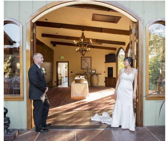
Love is in the air Photography

Grandma's House: Now used as a Bridal Suite, Grandma's House is very reminiscent of a past era. Built in 1950, much of the original décor is still visible and is available for the bride to prepare in homey comfort. All antiques were hand selected for the house and every room is fitted with a chandelier. A brick wall encloses the courtyard makes for perfect backyard style photographs. Bridal Suite is available 2 hours prior to ceremony.