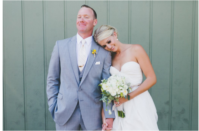
Two Foxes Photography