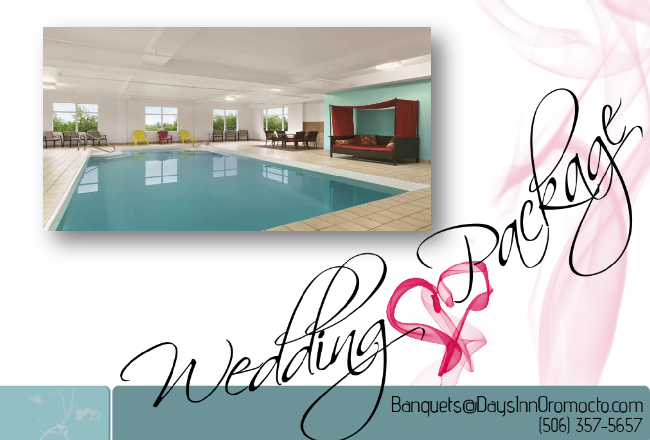
Heated Salt Water Indoor Pool