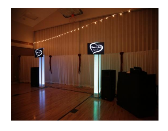
Goalie Post Trussing Unit & TV Monitors