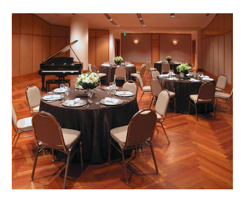
HORCHOW HALL in the HART SYMPHONY SUITES

The Hart Symphony Suites located on the Lower Lobby level of the Meyerson may be rented independently from other areas of the Meyerson or in conjunction with Concert Hall and/or Lobby uses. The fee structure will be determined by this relationship and the number of rooms used. Components of the Hart Symphony Suites include: