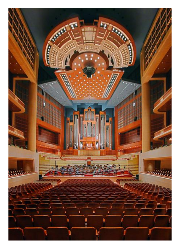
EUGENE McDERMOTT CONCERT HALL