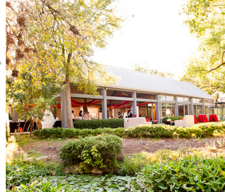
cory ryan photography