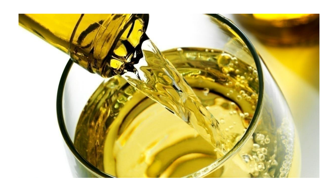
*Liquor brands may vary.