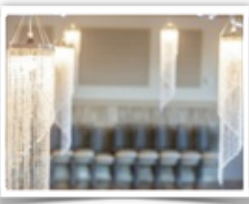
SPIRAL CHANDELIER (SIX AVAILABLE)