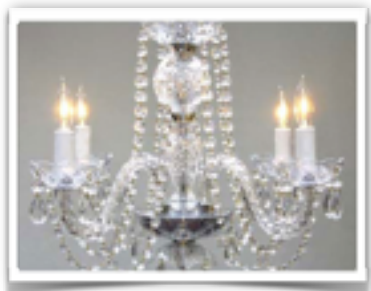
VINTAGE CRYSTAL CHANDELIER (SIX AVAILABLE)