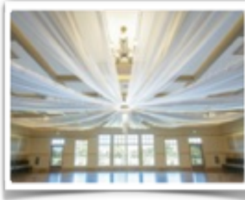
FULL SPOKE WITH LIGHTS AND CHANDELIER

GRID DIMENSIONS: 16' by 16'. Weight capacity per grid is 200lbs.