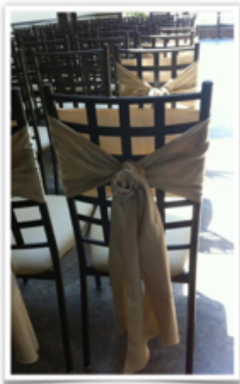
Chair Ties $3.00 per chair (inclusive of set-up and take down)

Specialty linens are included for all round guest tables on the weekend. Other linen options are available for an additional fee including chair ties, overlays and runners.