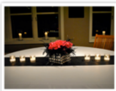
SOLID COLORED SPECIALTY RUNNER $8.00 to $10.00 (Inclusive of set-up and take down)